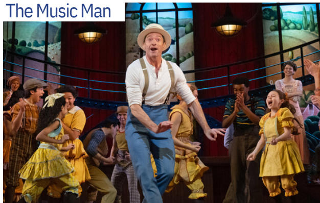
The Music Man

Two-time Tony Award®, Grammy Award®, and Emmy Award® winner Hugh Jackman stars in The Music Man.